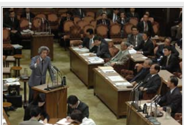
ON THE WARPATH? Japanese Prime Minister Junichiro Koizumi answers questions regarding a set of war contingency bills at a parliamentary session in Tokyo

The white paper also stressed that "Japanese-U.S. cooperation should be