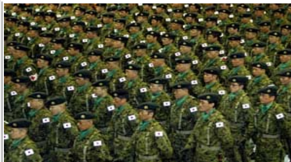
READY TO GO: Japanese Self Defense Force troops sent to Iraq mark the nation's first military deployment to an overseas war zone since World War II

strengthened on global affairs.” According to the three bills for military emergencies, when Japan, or its neighboring regions, has an emergency, the country is supposed to afford civilian land for U.S. troops to build up military positions, as well as offer materials and labor services. If necessary, it will also support the U.S. Army with ammunitions. In return, Japan can receive similar support from the United States, wherever it dispatches overseas troops worldwide. In this way, the function of Japanese military forces realized a transition from “invasion defense” to “overseas intervention.”